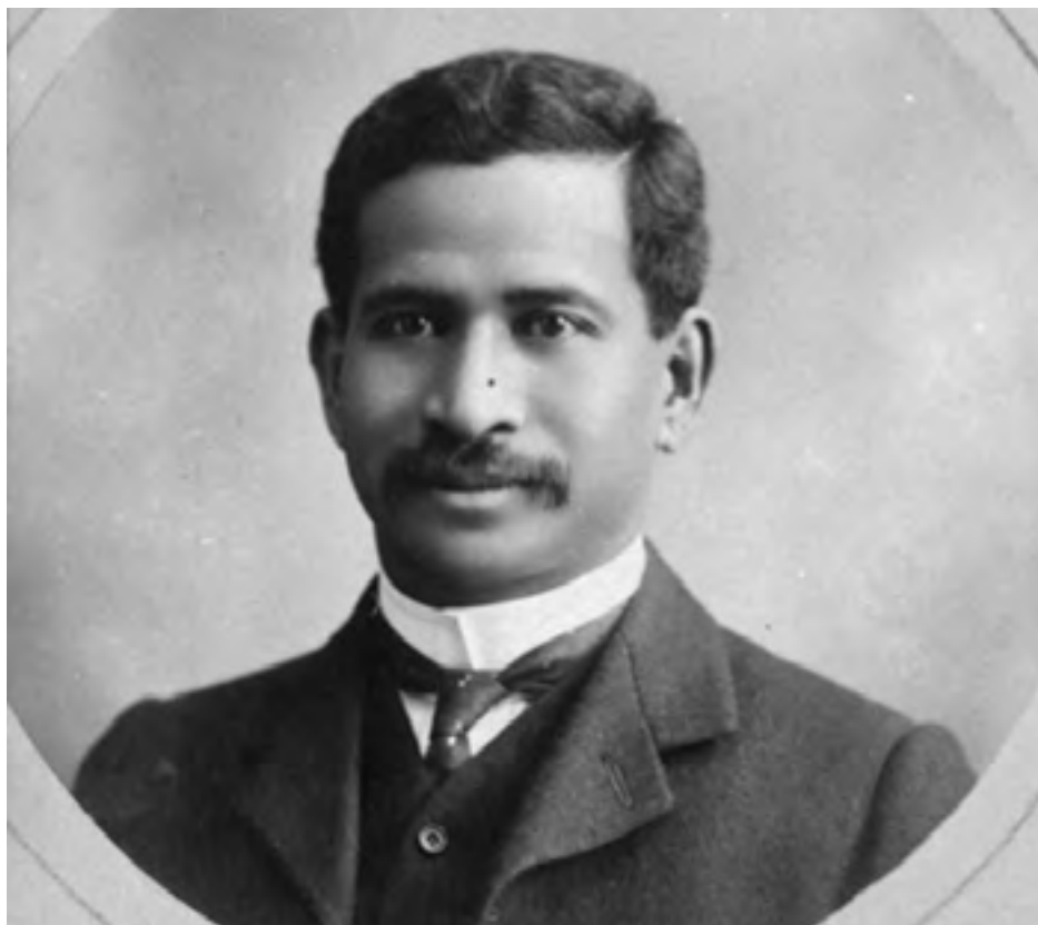
Above: Apirana Ngata around 1905, an official Parliamentary portrait used on the $50 note.