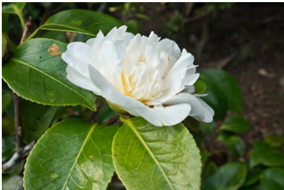
Above: White camellia (Camellia japonica 'alba plena') in the Wellington Botanic Gardens.

domestic gardens, the one Sheppard used was a specific species. An effort to locate a public specimen to be photographed revealed that few of that particular type existed in public gardens anywhere in New Zealand, and that their flowers had a short lifespan before deteriorating. However, one was newly flowering that very day in the Wellington Botanic Gardens.