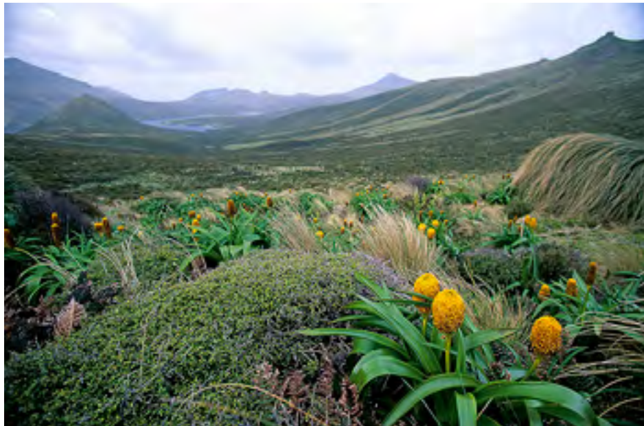
Campbell Island scene with the Ross Lilly in foreground, themes selected for the Series 5 $5 note, and retained for Series 6 and 7.

While the earlier selection of people, scenes, flora and fauna were retained for Series 7, the specific pictures – with the exception of most of the portraits – were renewed. One of the main motives for this decision was rights administration. Although full rights had been obtained in 1991–92 for the specific images used in the notes, fresh permissions had to be obtained for use in a completely new series, and a 2012 study by the Bank identified that this was likely to be complex. By the early 2010s, some of the original photographers had passed away, and in other cases