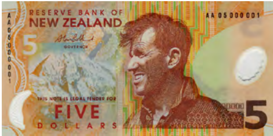
Obverse of the Series 6 $5 note, printed on polymer and featuring 'windows' with diffraction features.

The decision was made to switch New Zealand's currency to a polymer substrate in the late 1990s. From this emerged Series 6, which began entering circulation from 1999. These notes used the same designs as Series 5, slightly modified to incorporate the 'window' security features.